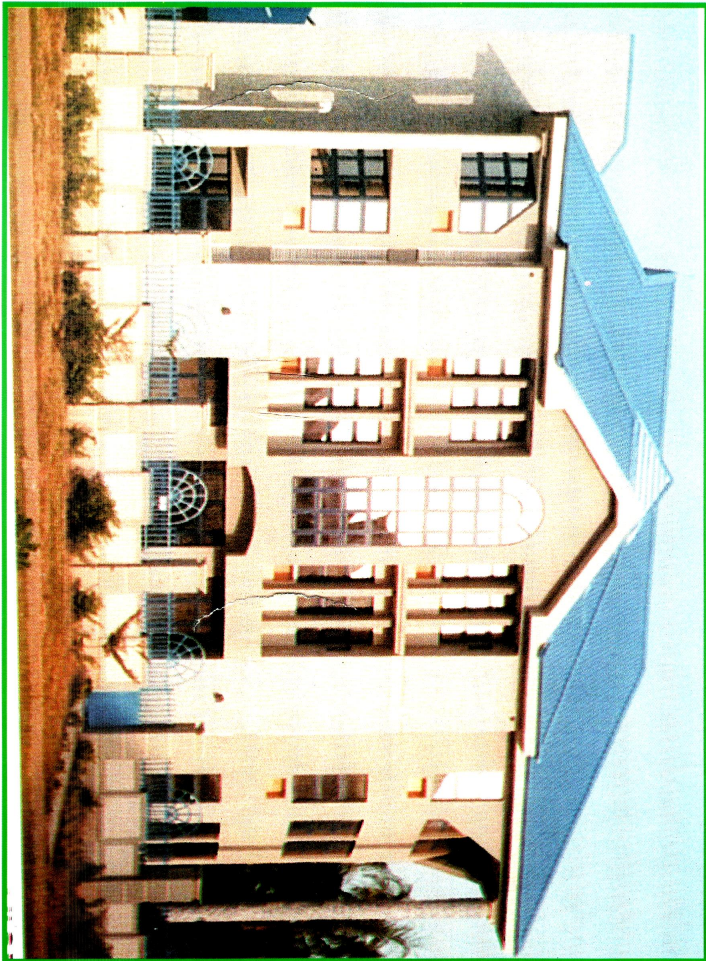
REAR VIEW OF THE SEAT OF THE COURT