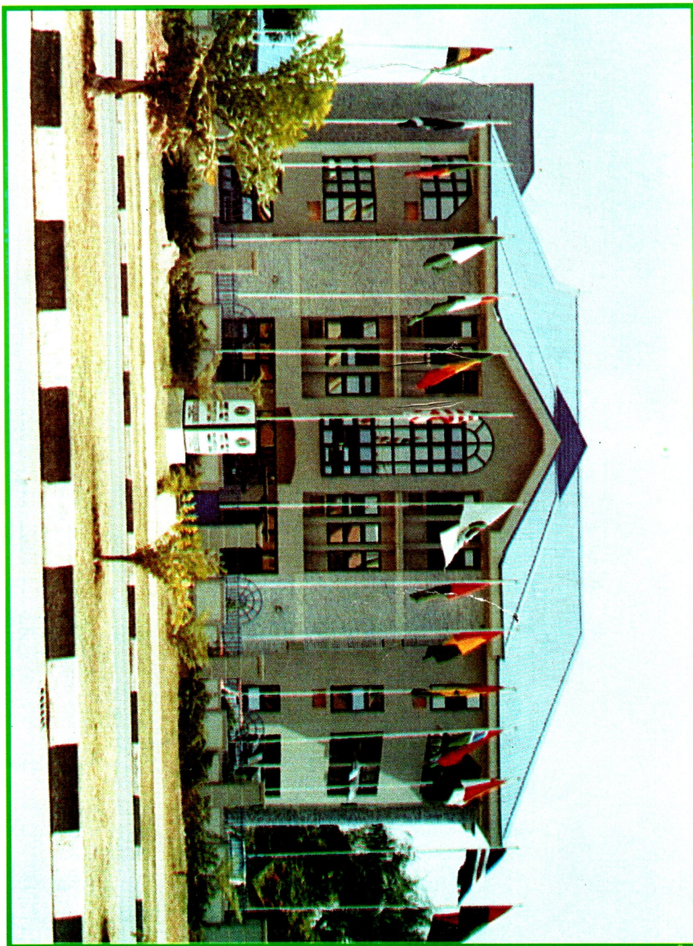
FRONT VIEW OF THE SEAT OF THE COURT