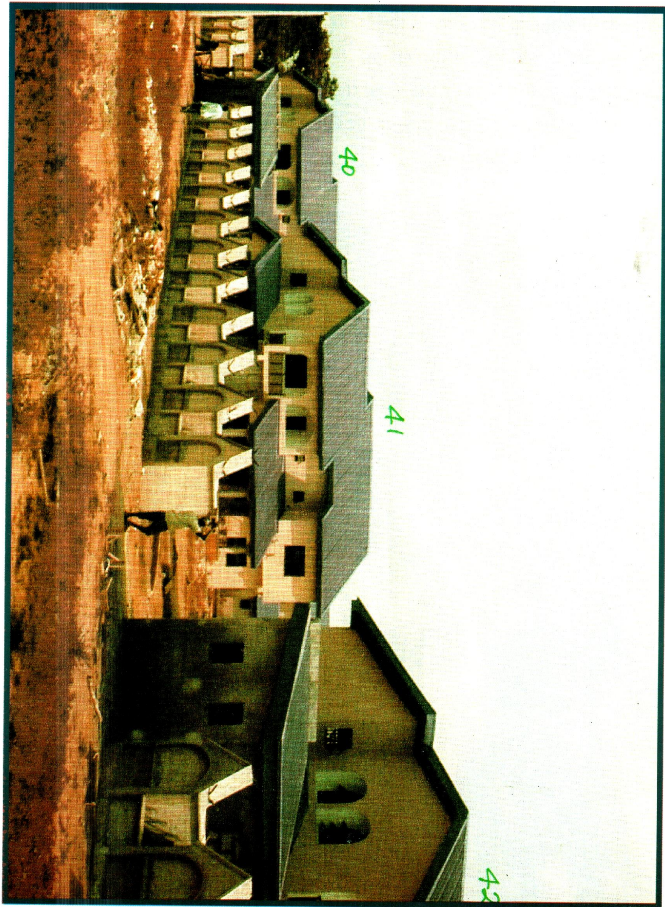
VISIT TO MEMBER RESIDENTIAL QUARTERS