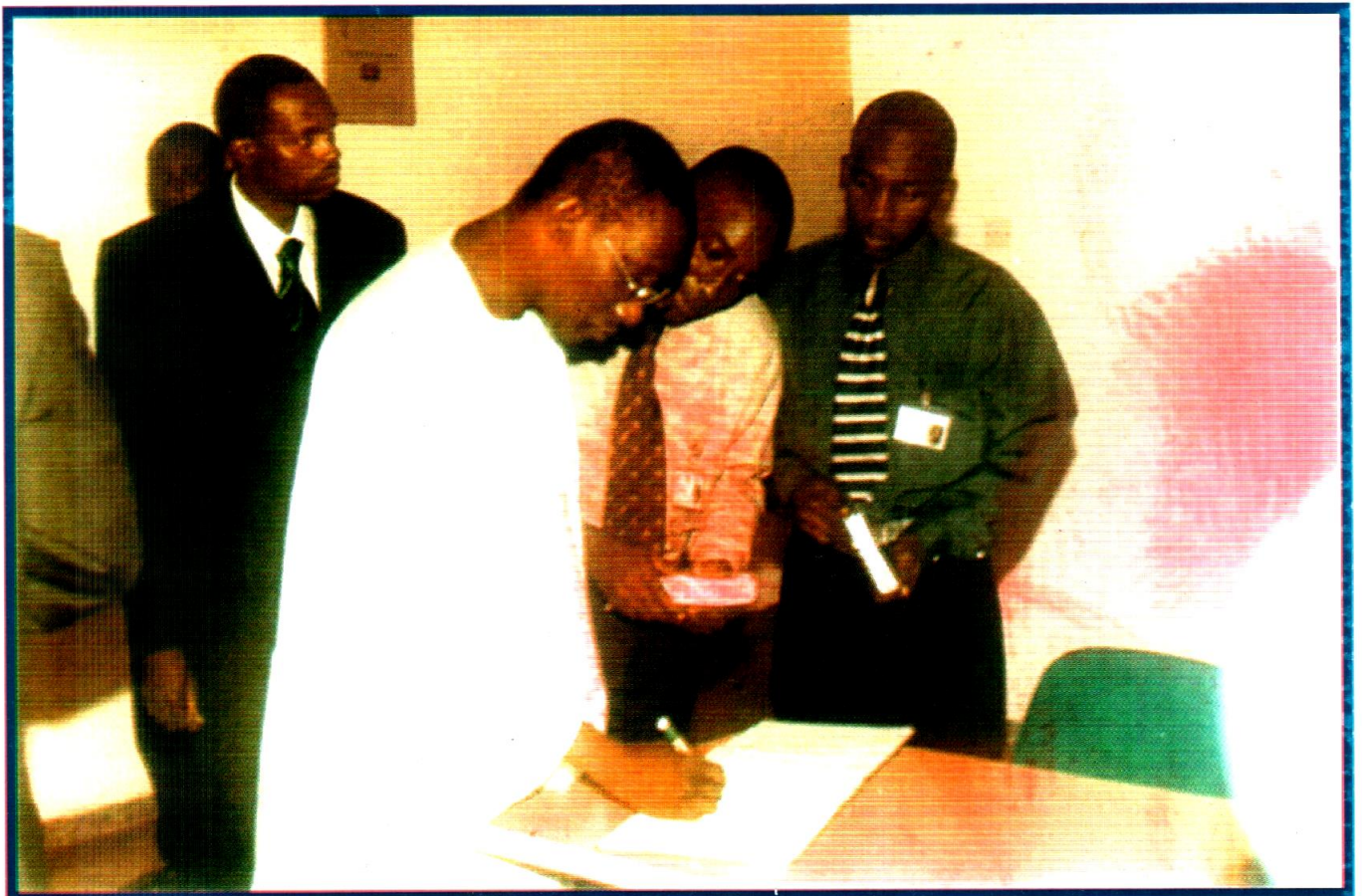
SHOTS FROM THE VISIT OF ECOWAS COUNCIL OF MINISTERS

81. The ECOWAS Council of Ministers, after the approval of the Rules of the Court, at the Sixth Extra-Ordinary meeting held on 28 th of August 2002 in Abuja, Nigeria, paid an unscheduled visit to inspect the Seat of the Court.